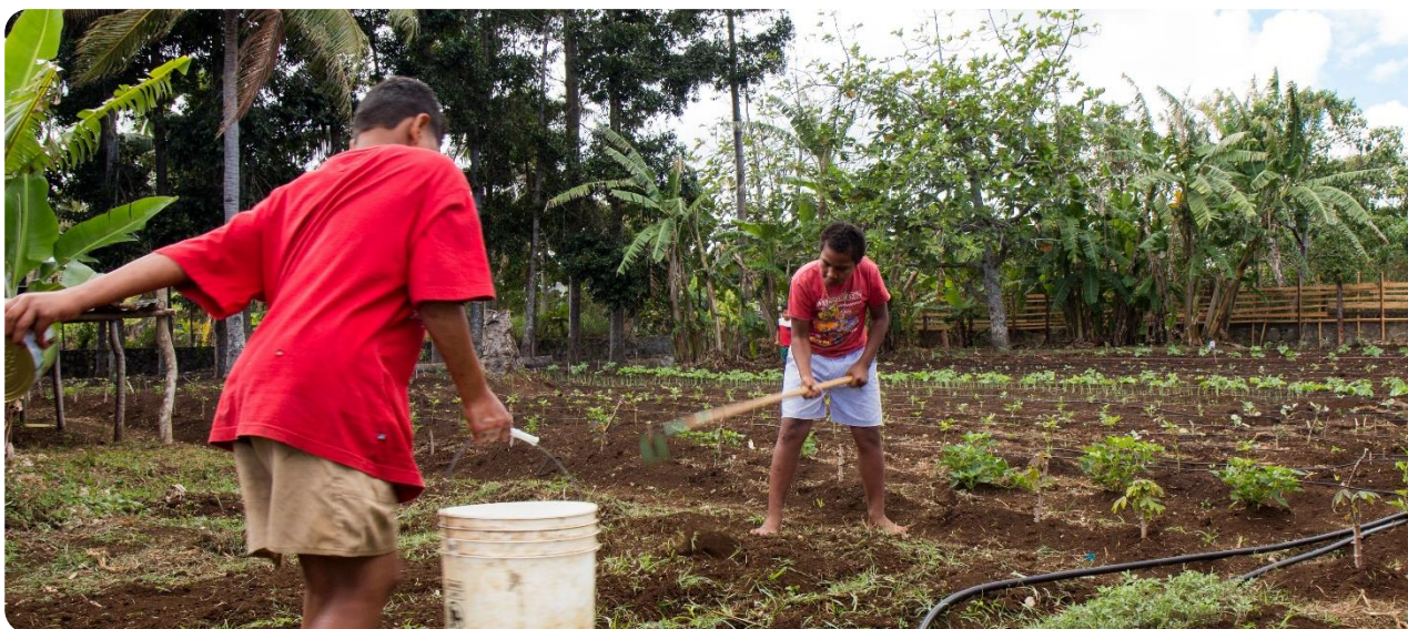
Ha'alalo School Garden project supported by DAP grant in 2015

The Direct Aid Program is a competitive small grants program funded by the Australian Aid program. Grants of up to 8000 pa'anga are available for proposals that can demonstrate a strong benefit to local communities in line with the priorities of the Australian Aid program in Tonga.